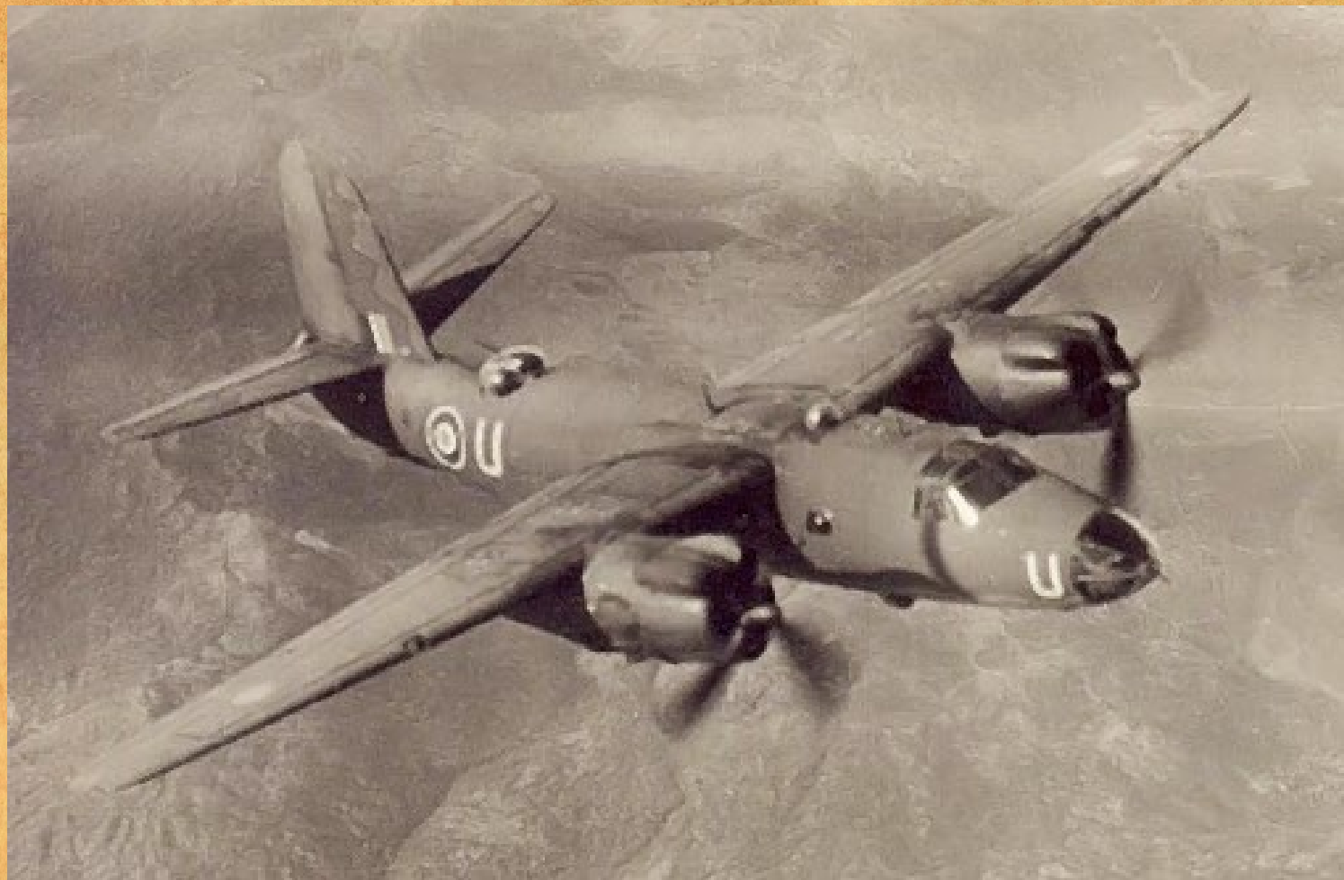
SAAF Martin B26C Marauder during WWII. Coded "U"