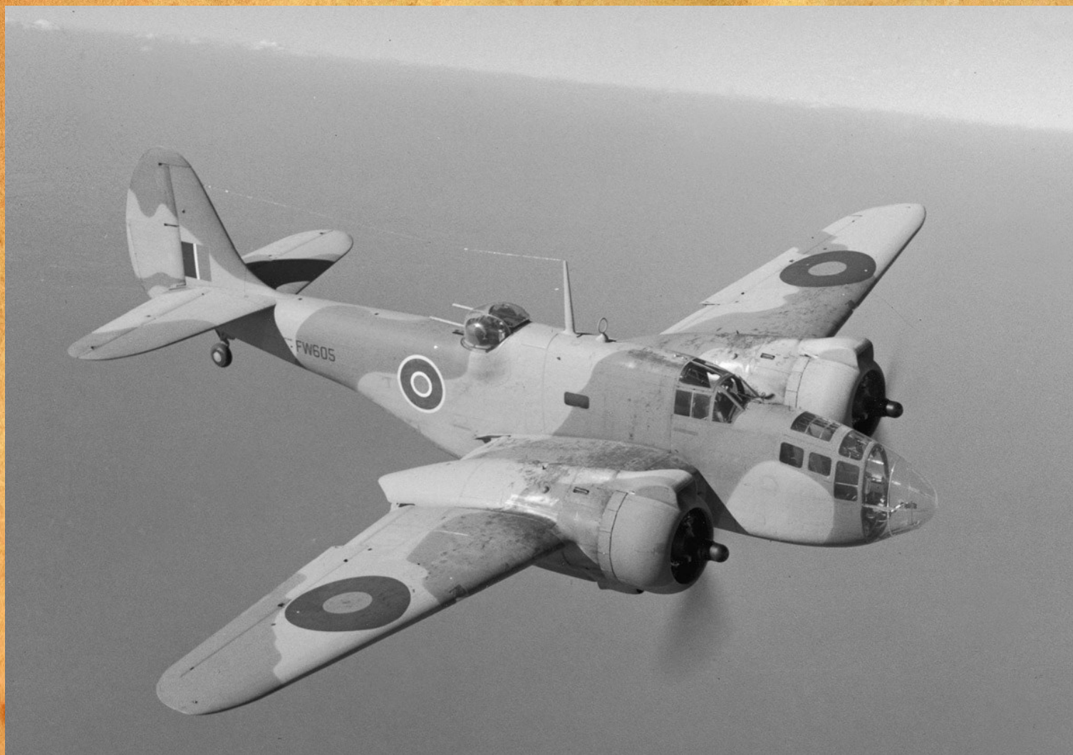
43-8762 Martin A-30A-20-MA to RAF as Baltimore V (FW605) 454 or 459Sqn. RAAF.